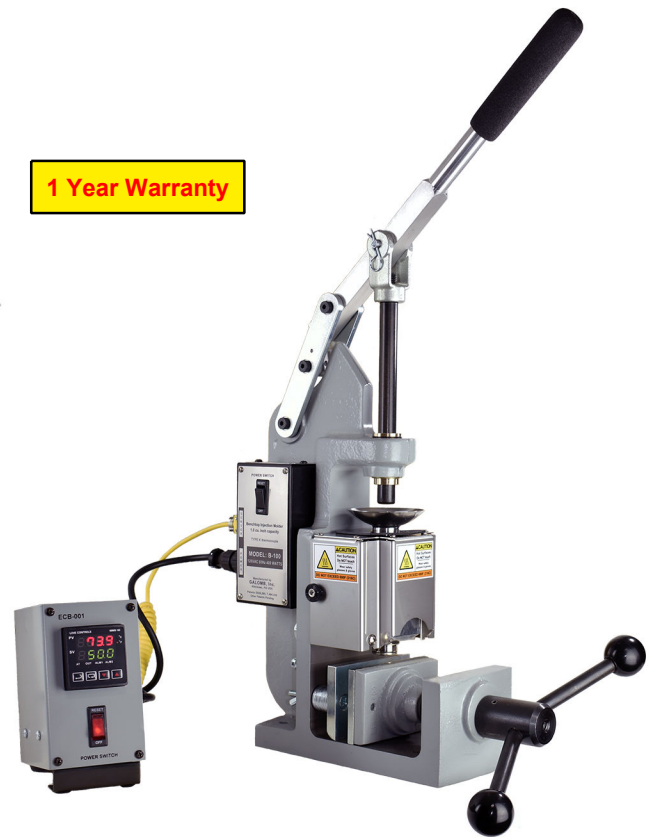
Model B-100 Injection Molder & ECB-001 controller